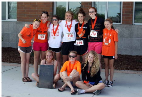
The 1st Place High School Team—LC!

The First Annual Teen Closet 50 (TC-50) was a huge success on Sunday, June 5, as 101 runners made their way from high school to high school in